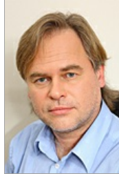
Eugene Kaspersky Chief Executive Officer

Eugene Kaspersky's love for mathematics determined his "technical" future. One of his hobbies during high school was to solve problems published in mathematical journals. During his last few years in high school, he attended extracurricular classes in physics and mathematics at a dedicated program organized by the Moscow Institute of Physics and Technology. Eugene spent his last two years of high school taking physics and mathematics courses in a specialized program for gifted students organized by and affiliated with Moscow State University.